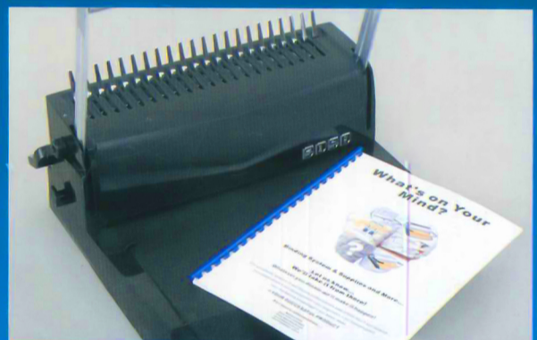
Closing the plastic comb